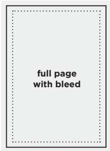
FULL PAGE (must include bleed)

Final Bleed Size: 8.25"(w) x 10.75"(h) allow 1/8" on all sides for bleed