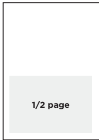
HALF PAGE 7"(w) x 4.5"(h)