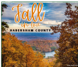
300 x 250