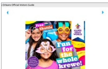
C Interstitial Content