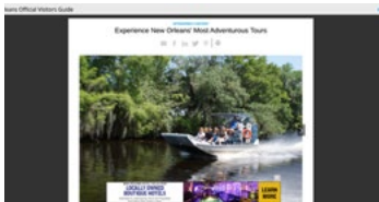
B Native Content